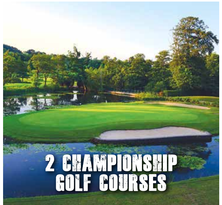
2 CHAMPIONSHIP GOLF COURSES