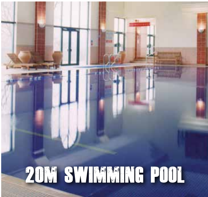
20M SWIMMING POOL