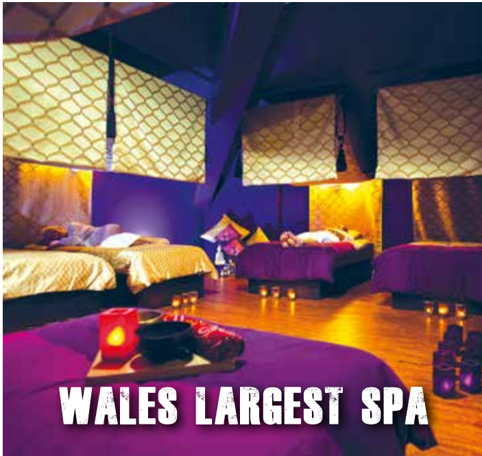
WALES LARGEST SPA