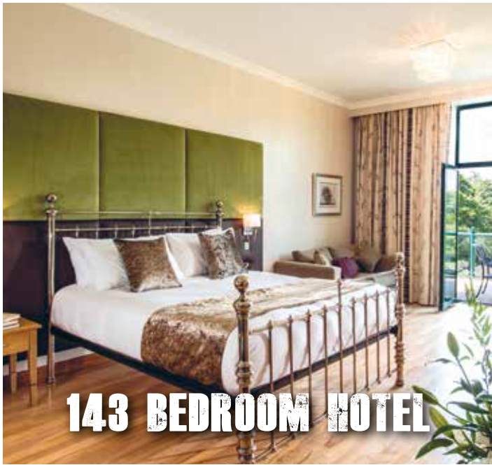
143 BEDROOM HOTEL