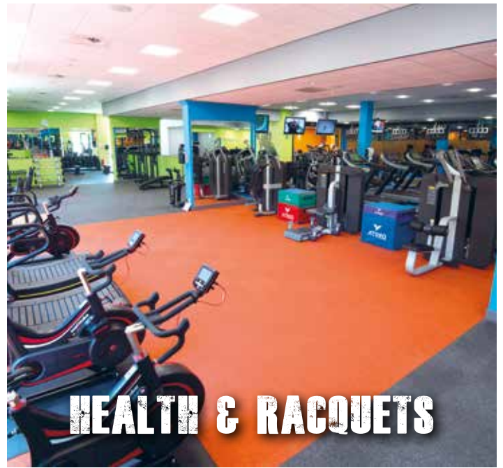
HEALTH & RACQUETS