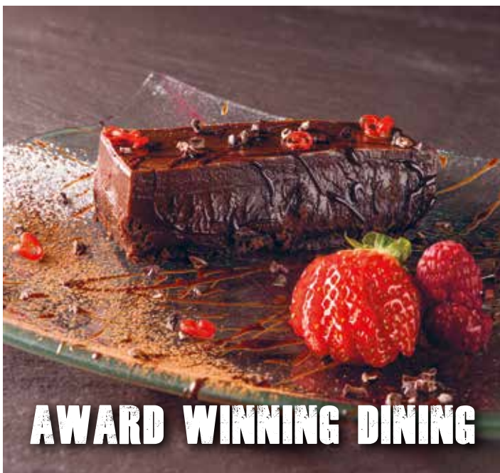
AWARD WINNING DINING